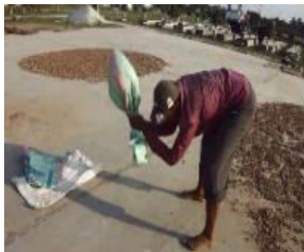
Fig 1. : Manual Method of Polishing

Polishing machine capacity is greater and it furnished quality of turmeric which not possible in hand polishing.